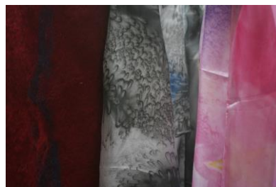
Lynn Bennett Mackenzie & Sheila Bates ~ detail of silk & felt scarves