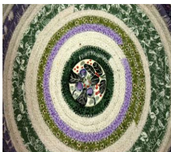
Lorraine Newman ~ detail of ropework bowl